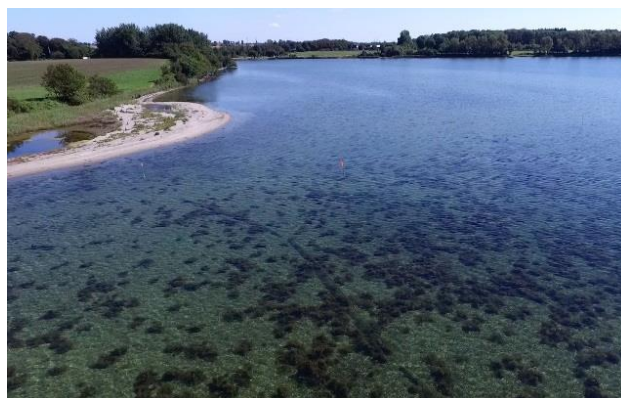
Recreational inspection with a drone

In 2016, the Danish AgriFish Agency used drones as a tool in the inspection of recreational fishing. The first tests with drones have shown that overflight with drones in shallow areas and conservation zones with fishing bans provide a quick and good image of any fishing activity. Especially shallow areas can be difficult to inspect from boat and the information from drone flights makes it easier to assess whether additional inspection is required. The Danish Agency for Agriculture and Fisheries will continue and develop the use of drones for inspections in 2017