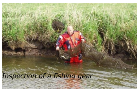
Inspection of a fishing gear

The number of inspections increased from 1.990 in 2015 to 2.056 in 2016, equivalent to an increase of 3 %.