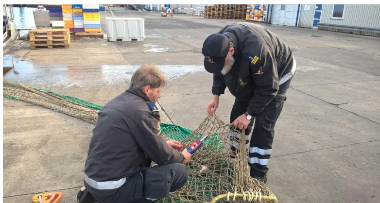
Checking mesh size

2,809 inspections were performed at landing equivalent to an inspection rate of 3.8%. In 2015, the inspection rate was 3.5%. In 2016, 560 inspections were carried out at sea and there were 791 observations of fishing vessels without boarding of the vessel.